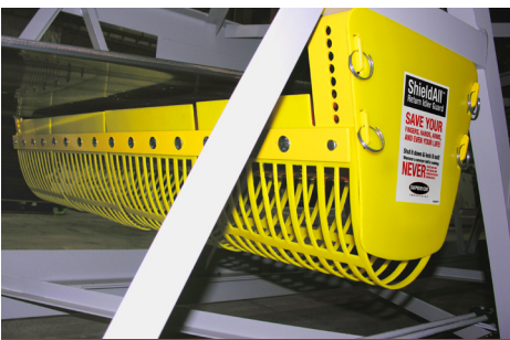
SHIELDALL™ RETURN GUARD