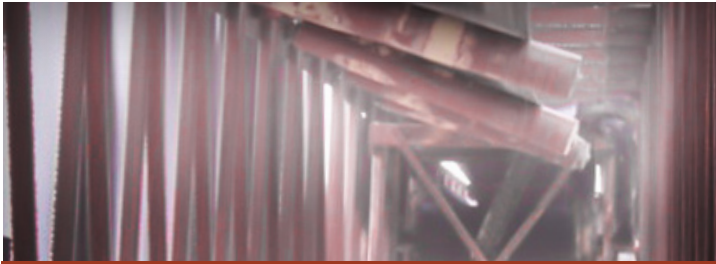
PROTECT YOUR CREW FROM FALLING RETURN ROLLS