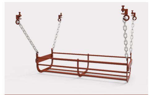
RETURN IDLER BASKET